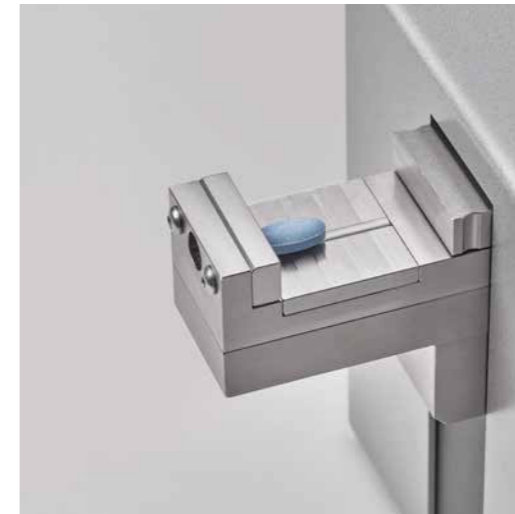
Quick-change tongue with groove for easy alignment of convex shapes

The highly accessible test area accepts all types of shapes, sizes, and materials. Optimized jaw movements provide short cycle times, while quick-change tongues allow for simple tablet handling by the operator. Clip-on jaws further extend the MT50 testing capabilities for 3-point bending strength tests or other testing methods.