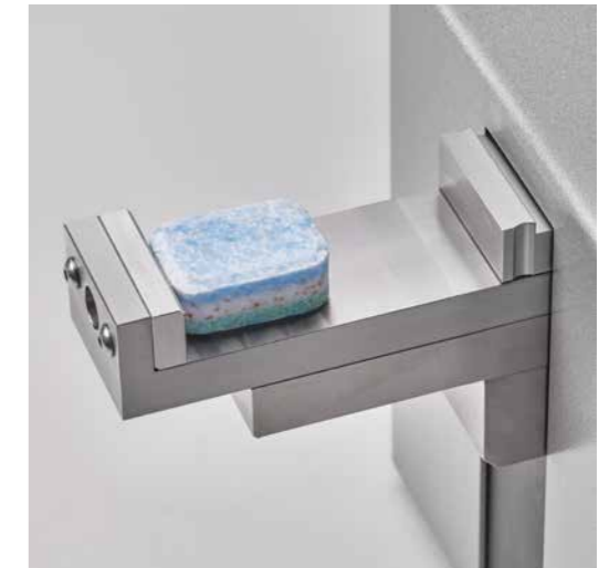
Extended jaw for testing large objects up to 65 mm