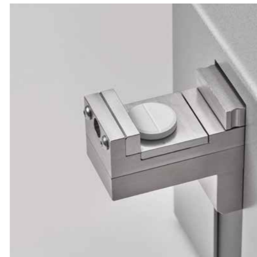
Quick-change tongue with flat surface