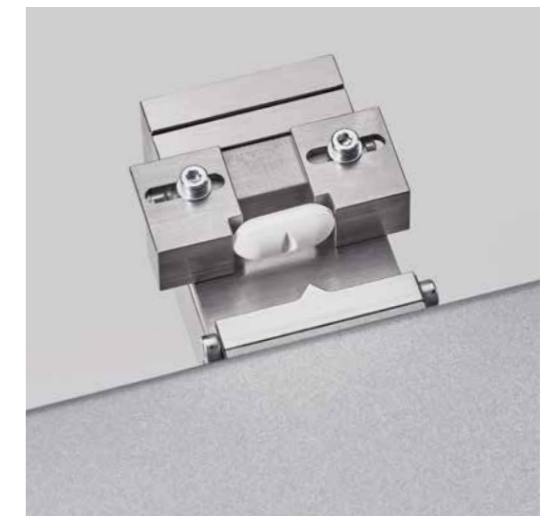
Clip-on jaws for 3-point bending strength test